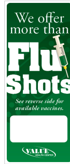
3.625" x 8.5" bag stuffer (2 sided)