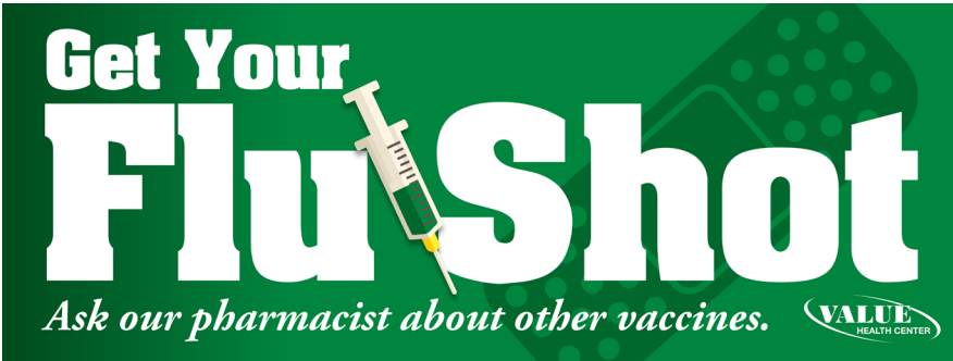
8' x 3' outdoor banner