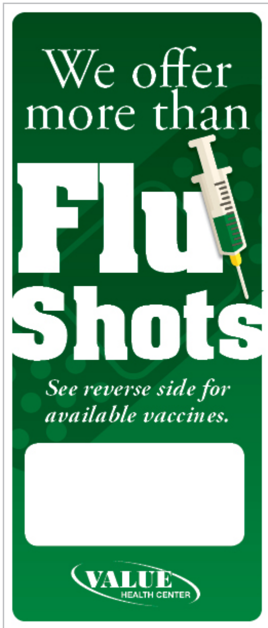
3.625" x 8.5" bag stuffer