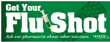
12" x 4.5" window cling