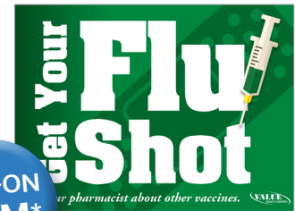
24" x 18" lawn sign