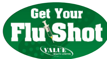
3" x 1.625" sticker